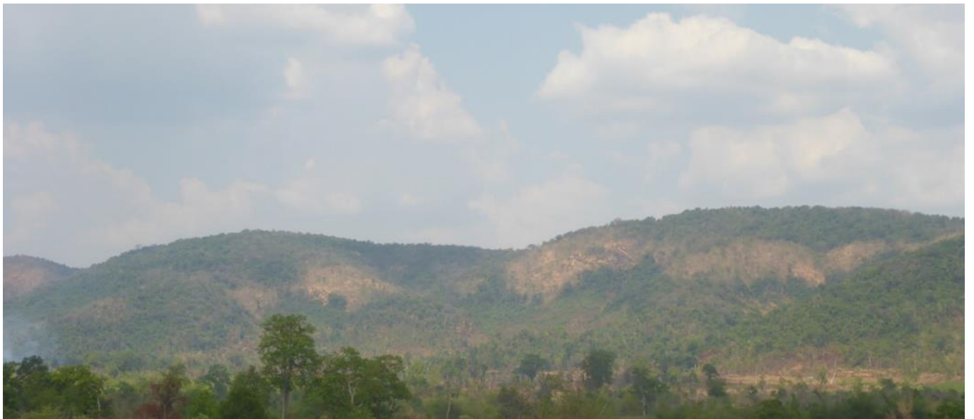
Figure 3 Massive sub-horizontal lithocap forming prominent cliffs