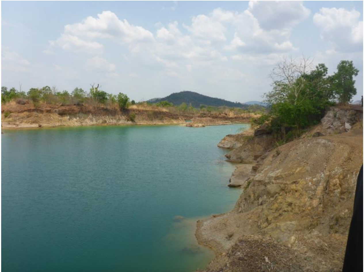
Figure 2 The Khvav open-pit Cu-Au mine just outside to the south of the Continental Copper exploration licences