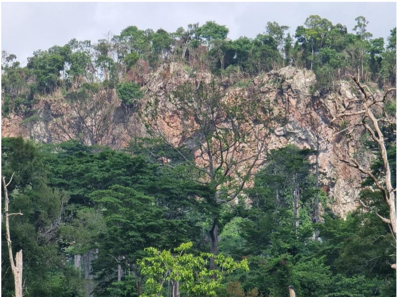
Figure 1 Residual and vuggy silica ridge - The Cliffs Prospect – Khvav Project, Cambodia. The Cliffs vuggy silica and vuggy silica breccia extends over a width of more than 500 metre and along a strike of 4km.